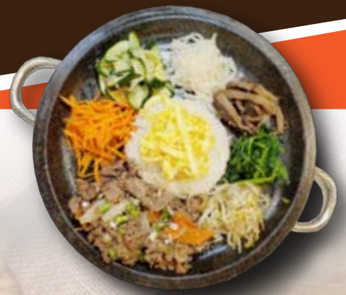
돌판 비빔밥 Bibimbap. $15 Choice of one meat, Boolgogi / Spicy pork / Chicken Spicy squid / Fried tofu