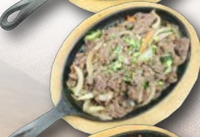
불고기 Boolgogi. $19 Thinly sliced marinated beef with vegetables