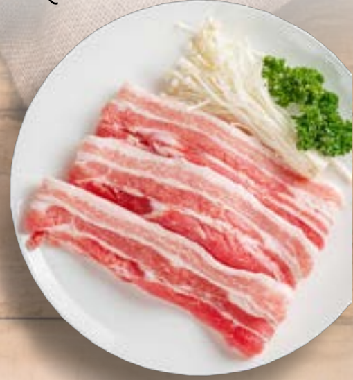
삼겹살. $21 Pork Belly (Thick Cut)