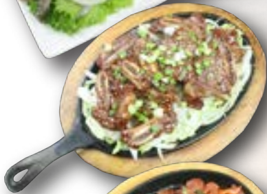
LA 갈비 LA Kalbi. $27 Grilled marinated beef short ribs