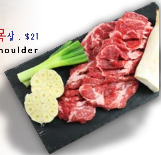
칼집 목살. $21 Scored Pork Shoulder