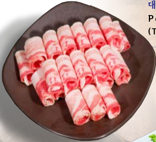
대패 삼겹살. $19 Pork Belly (Thin Cut)