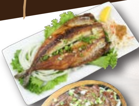
어머니와 고등어 Grilled Mackerel. $16