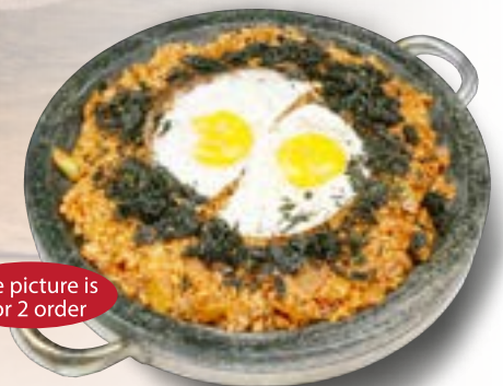
김치볶음밥 Kimchi Fried Rice. $12 (1 order) Fried rice with Kimchi and beef, roasted seaweed and egg.