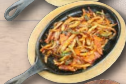
오징어 볶음 Spicy Squid. $17 Spicy stir fried squid and vegetable