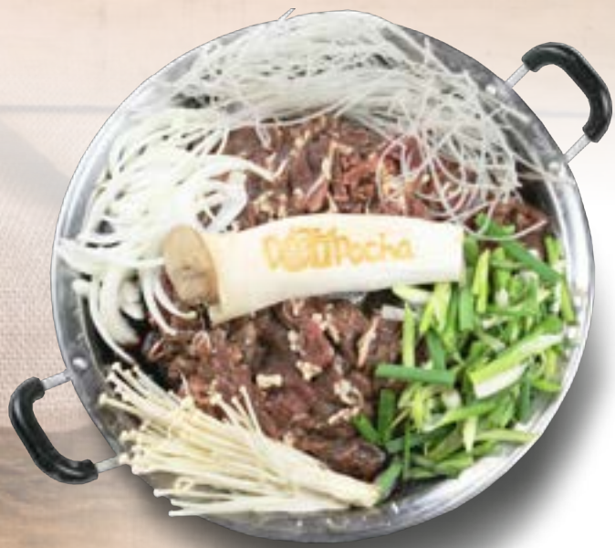
서울 불고기 Hot Pot Boolgogi Chicken. $36 or Beef. $42 Marinated sliced beef or chicken with vegetables