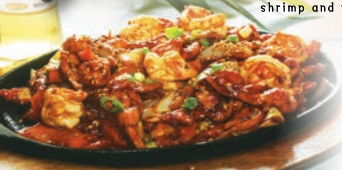
매운 새우 닭볶음 Mae Sae Dak. $21 Stir fried chicken (dark meat), shrimp and vegetables in spicy sauce