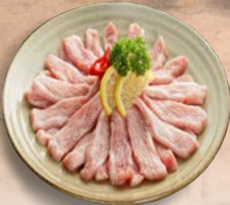
항정살. $23 Pork Jowl