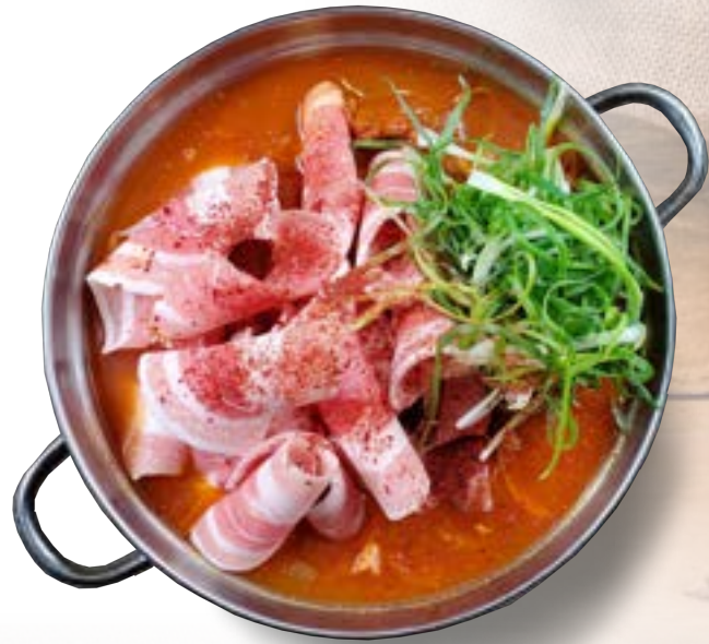
정육점 김치전골 Kimchi Jeongol. $29 Kimchi stew with pork belly