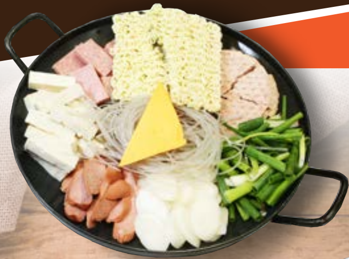
의정부 부대전골 Boodae Jeongol. $32 Spam, hotdog, beef patty, rice cake, sweet potato noodle, cheese and kimchi in spicy soup. Extra ramen noodle $2.5