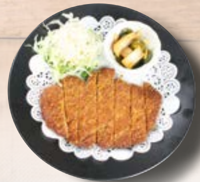
돈까스 Pork Cutlet . $15 Breaded deep fried pork tenderloin served with a side of fruit sauce