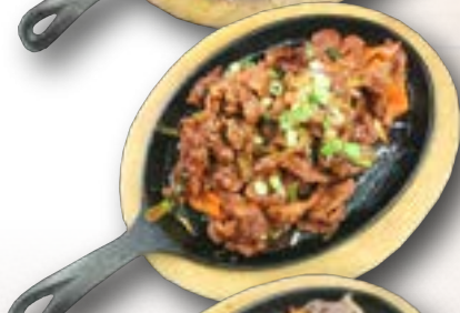
돼지 불고기 Spicy Pork. $16 Spicy marinated pork with vegetables