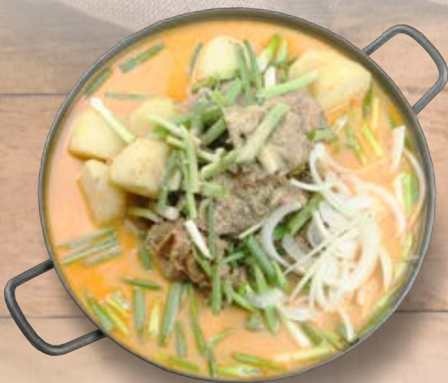
삼더미 감자탕 Gamja Tang. $35 Pork neckbone soup with potato, napa green onion