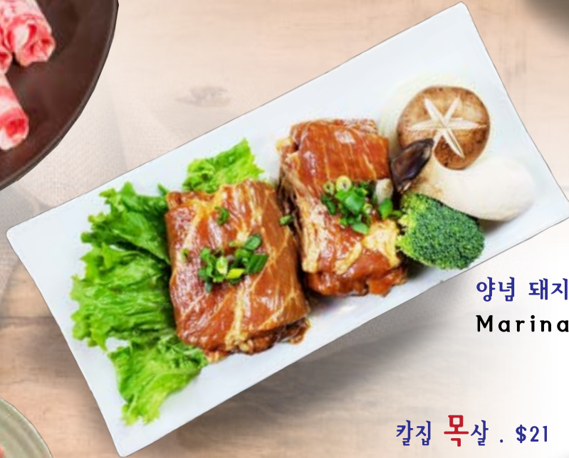
양념 돼지갈비. $28 Marinated Pork Rib