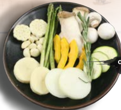
야채구이 Vegetable BBQ $16