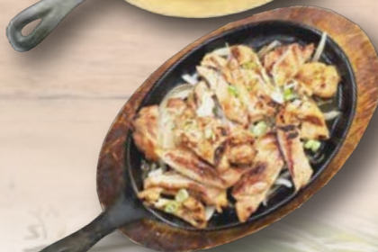
닭 불고기 Chicken Boolgogi. $18 Grilled marinated chicken dark meat