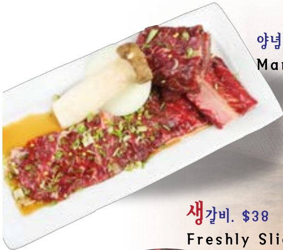
양념갈비. $36 Marinated Beef Short Rib